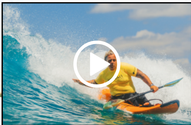
HASC 2025 Photo Gallery